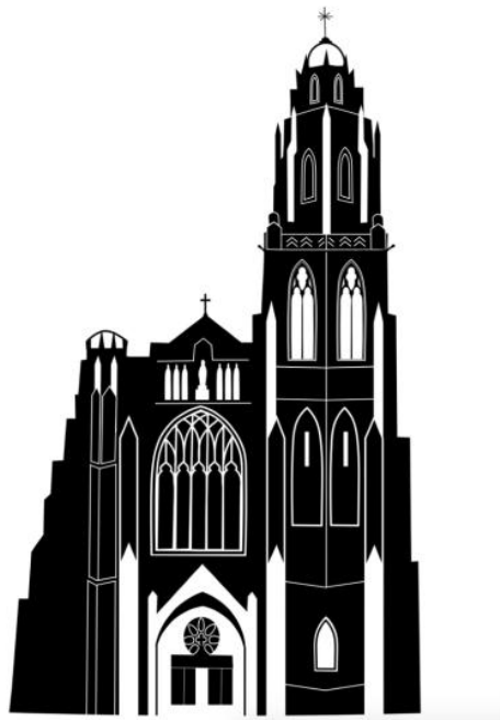
The Cathedral of St. Agnes Rockville Centre, New York